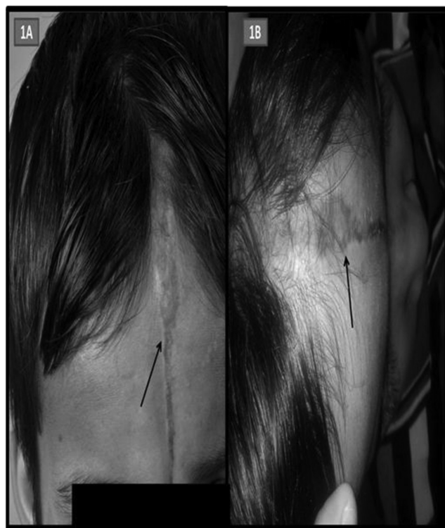
Abstract 368 Figure 1

and V sign. She also had swallowing difficulty proven by abnormal videofluoroscopic swallowing test. Laboratory findings showed anaemia, thrombocytopenia, elevated muscle enzymes, hyperferritinemia and hypertriglyceridemia. The autoimmune profile revealed positive antinuclear antibody (1:160, homogenous pattern) and negative anti-Jo-1 antibody. In addition to electromyography and skeletal muscle biopsy, bone marrow biopsy was performed to find the cause of microangiopathic hemolytic anaemia and thrombocytopenia. Numerous CD68-positive macrophages engulfing erythrocytes and platelets were revealed in bone marrow study. She was finally diagnosed as DM with secondary HPS. After steroid pulse therapy for 3 days, we continued high dose steroid therapy for 1 month. Thereafter, we gradually tapered the steroid and started methotrexate. After 1 year of treatment, she was completely recovered from muscle weakness, swallowing difficulty, skin lesions and cytopenia.