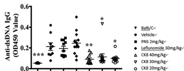
Abstract 98 Figure 2